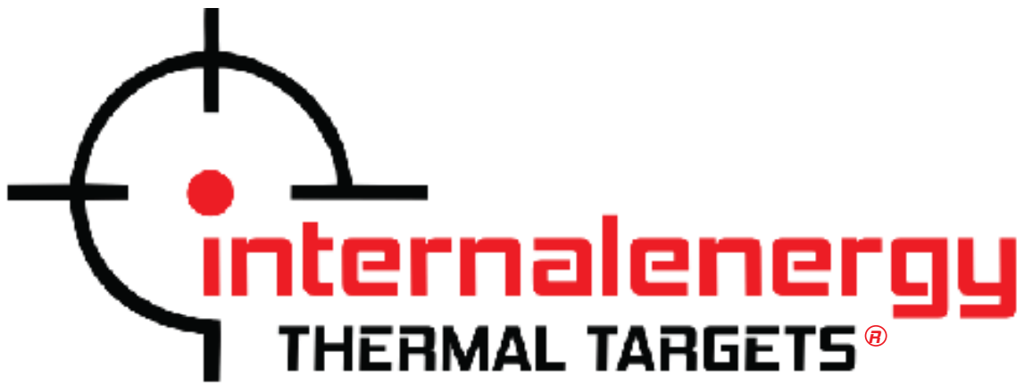
PHOTO-REALISTIC PASSIVE TARGETS